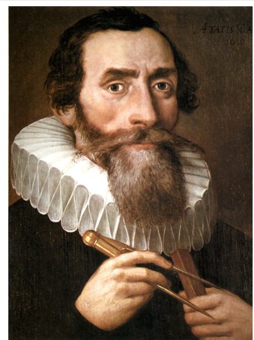
Figure 1: Johannes Kepler.

The Scottish physicist James Clerk Maxwell (1831-1879) was fascinated by the embodiment of geometric patterns and the dynamic forms exhibited in creation. In 1874, when he designed the famous